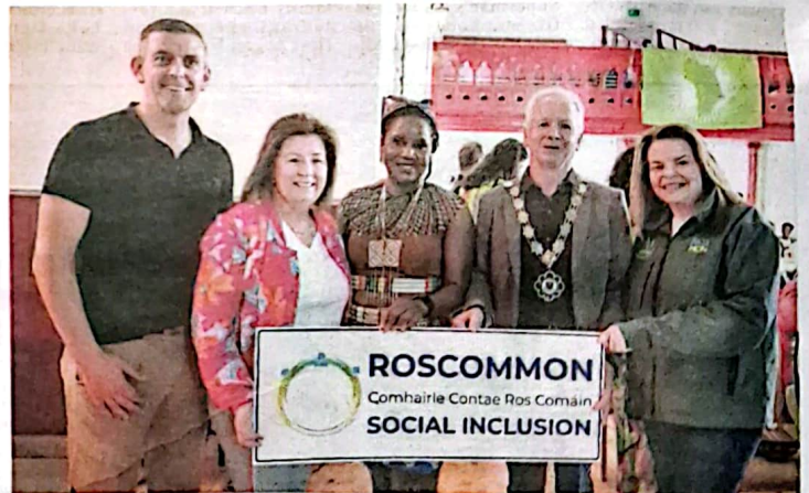
Africa Day celebrations at the Trinity Arts Centre, Castlerea were a success.