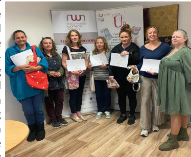
Photo of trainees who completed the Introduction to Upcycling Textiles course in June

CycleUp Textiles continues to grow from strength to strength with the announcement of community services program (CSP) funding by the Department of Rural and Community Development and Pobal and funding was also confirmed in July for the RWN CycleUp Textiles Skills and Product Innovation Project which is co-funded by the Government of Ireland and European Union through the EU Just Transition Fund Programme 2021-2027. Upcycling Textiles Training continued over the summer months with an Introduction course being completed in Castlereagh in June, and in September we will be running an Upcycling Textiles Introduction evening course in Athleague and an Intermediate day time course in Castlereagh.