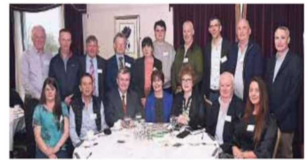
Local election candidates at an event for women in advance of the local elections organised by Roscommon Women's Network and Roscommon County Council.