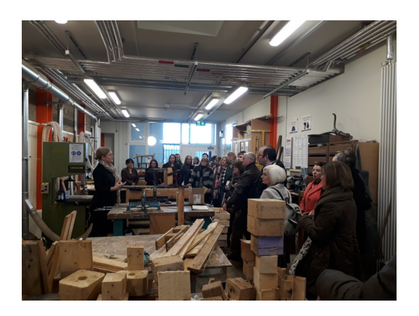
Volunteers/trainees & staff inspired at their visit to Balllymun Rediscovery Centre